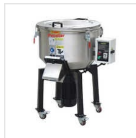
Vertical Plastic Mixer Machine