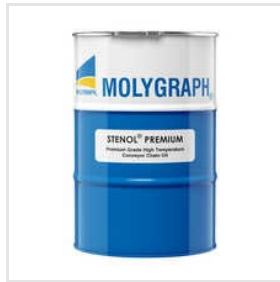
Safol High Temperature Chain Oil