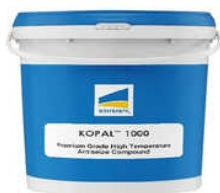
KOPAL COPPER BASE GREASE ANTISEIZE COMPOUND

C Type Mold Clamp, Industrial Granule Auto Loader, Industrial Hopper Dryer, Industrial Proportional Valve, Kopal Copper Base Grease Antiseize Compound, Material Storage Mixer, Metal Separator For Plastic Granules, PVC Low Speed Granulator, Plastic Granules Cutting Machine, Safol High Temperature Chain Oil, Safol-220 Food Grade Chain Oil, Shini Electric Cabinet Dryer, Sprue Picker Swing Arm Robot, Stainless Steel Hopper Magnet, Three Axis Robotic Arm, etc.