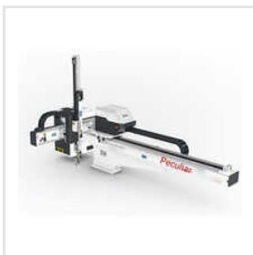
Three Axis Robotic Arm