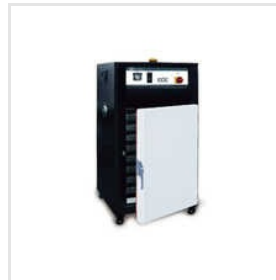
Shini Electric Cabinet Dryer