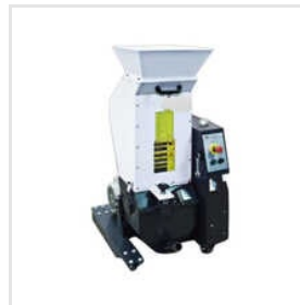
PVC Low Speed Granulator