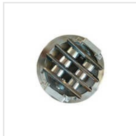
Stainless Steel Hopper Magnet