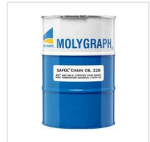
Safol-220 Food Grade Chain Oil