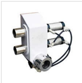
Industrial Proportional Valve