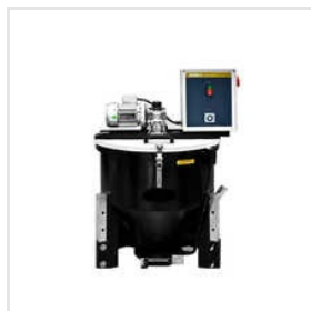
Material Storage Mixer