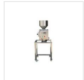
Metal Separator For Plastic Granules