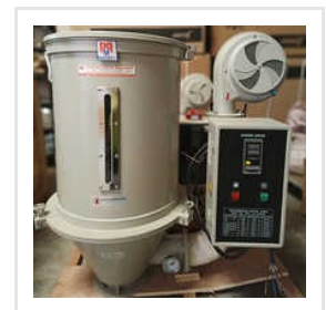
Industrial Hopper Dryer