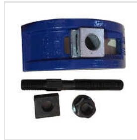
C Type Mold Clamp