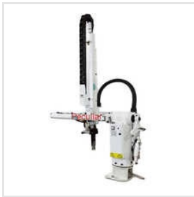
Sprue Picker Swing Arm Robot