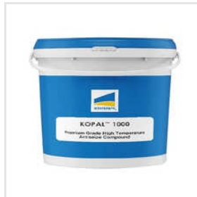
Kopal Copper Base Grease Antiseize