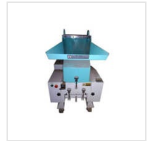
Plastic Granules Cutting Machine