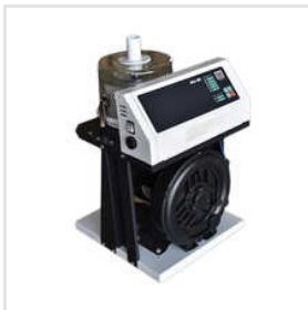
Industrial Granule Auto Loader