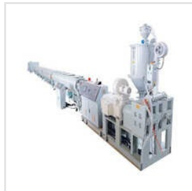
Hdpe Pipe Making Plant