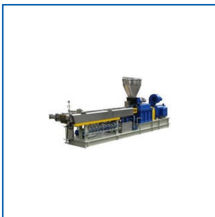
HDPE EXTRUDERS MACHINE

Automatic Conduit Pipe Machine, Automatic HDPE Pipe Plant, Automatic Screw Conveyor, Garden Pipe Extrusion Machine, Garden Pvc Pipe Making Machine, Groove Feed Screw Barrel, HDPE Extruders Machine, HDPE Pipe Cutting Machine, HDPE Pipe Extruder Machine, HDPE Pipe Traction Machine, HDPE Pipe Vacuum Sizing Tank, Hdpe Manual Extrusion Machine, Hdpe Pipe Extrusion Machine, Hdpe Pipe Making Plant, MS Single Screw, etc.