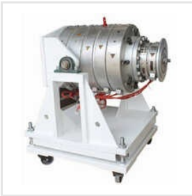
PVC Die Head