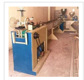
Garden Pipe Extrusion Machine