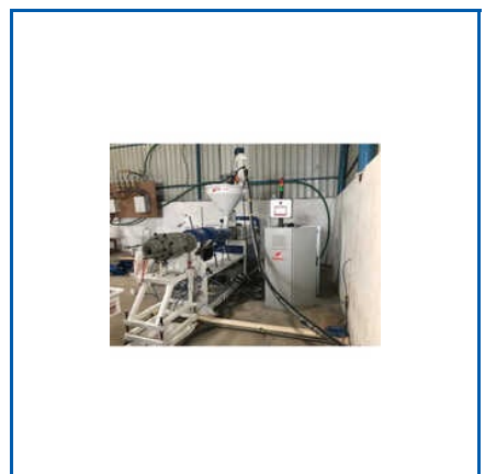
PVC PIPE TWIN SCREW EXTRUDER MACHINE