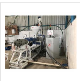
PVC Pipe Extrusion Machine