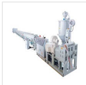
HDPE Pipe Extruder Machine