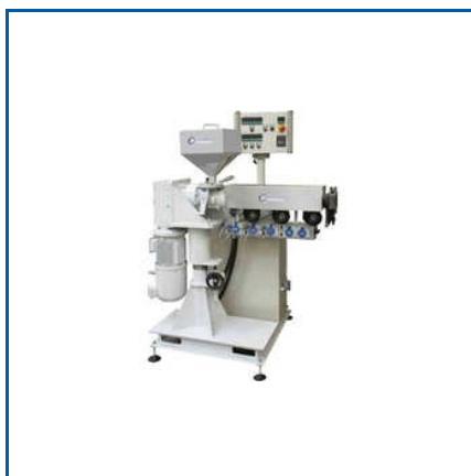
SINGLE JOCKEY AND CO-EXTRUSION PLANT