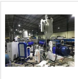
HDPE Pipe Extruder Machine