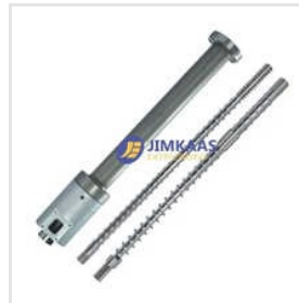
Single Screw Barrel For HDPE