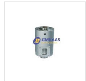
Groove Feed Screw Barrel