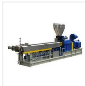
Hdpe Pipe Extrusion Machine