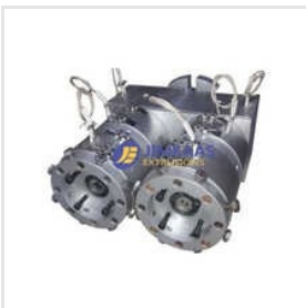
Twin Die Head