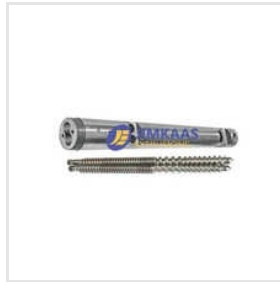
Twin Srew Barrel