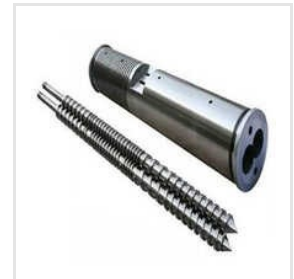
Twin And Single Screw Barrels