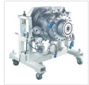
PVC And HDPE Die Head