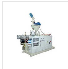
Pvc Pipe Extruder Machine