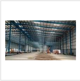
Platform Erection Work