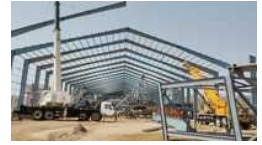
Pre Engineered Steel Building