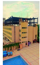
Floor For Hotel Building