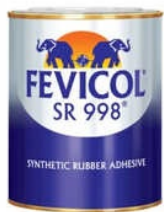
Fevicol SR998 Synthetic Rubber