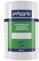
30LTRS Polygrip Synthetic Rubber