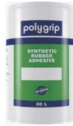
Atul MP TF Polygrip Synthetic Rubber