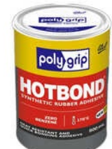
1ltr Polygrip Hotbond Synthetic Rubber