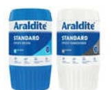
XIN 1.8 KG ARALDITE ADHESIVE