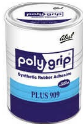
Polygrip Plus 909 Synthetic Rubber