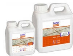
JR 150 LAPOX GRANITO ADHESIVE