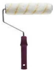
9 Inch Interior Painting Silk Roller With Twin