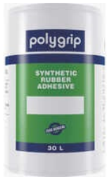
30L S 610 Polygrip Synthetic Rubber