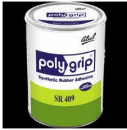
SR409 5L Polygrip Synthetic Rubber