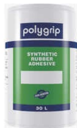
30L Atul GPU Polygrip Synthetic Rubber