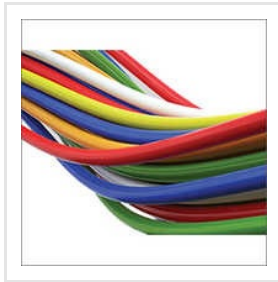
Fr-Lszh Hookup Xlpe Cable