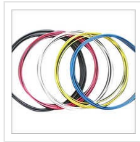
Iso 6722 Class C Automotive Wires