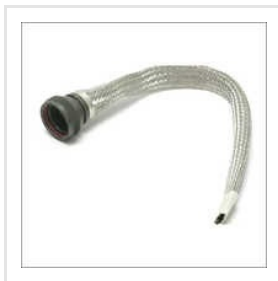
Plated Copper Braids