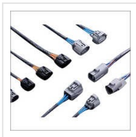
CIVUS Automotive Wires