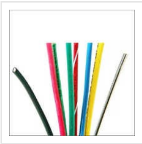
Cross Linked Hookup XLPE Cable