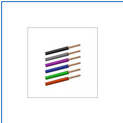
ISO 6722 CLASS E AUTOMOTIVE WIRE