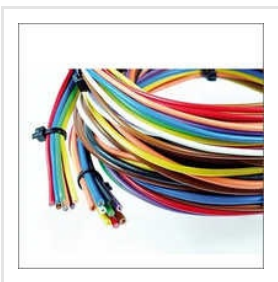
TXL Automotive Wires