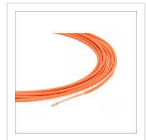
SXL Automotive Wires