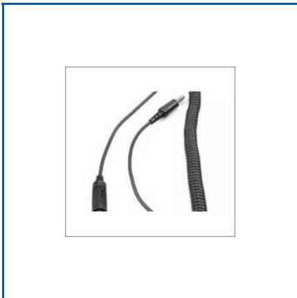
HELMET AND RADIO SYSTEM ASSEMBLY CABLES

AV and AVS Automotive Wires, Accelerometer and Vibration Sensor Cables, CIVUS Automotive Wires, Cavs Automotive Wires, Control Signal & Instrumentation Cable, Cross Linked Hookup XLPE Cable, Ete Hookup Xlpe Cable, FEP Hookup XLPE Cable, Ffly Type A And B Automotive Wires, Fr-Iszh Hookup Xlpe Cable, GXL Automotive Wires, etc.