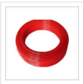
Etfе Hookup Xlpe Cable