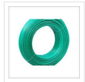
FEP Hookup XLPE Cable