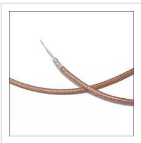
R.G. Coaxial Cables