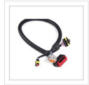
ISO 6722 CLASS D Automotive Wires