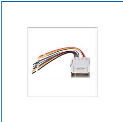
FLRY TYPE A AND B AUTOMOTIVE WIRES