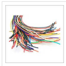
AV And AVS Automotive Wires