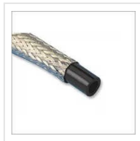
Light Weight Copper Braids