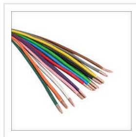
Cavs Automotive Wires