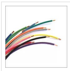
GXL Automotive Wires