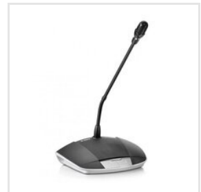
Bosch Discussion Device Long -CCSD-DL