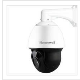
Honeywell PTZ Camera