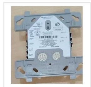
Notifier Monitor Module -FMM-I