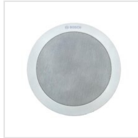
15W Ceiling Speaker - LC1-PC-15G6-6