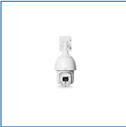
BOSCH 4MP PTZ CAMERA NDP-5523-Z30L-P