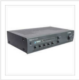
Bosch Amplifier 480W