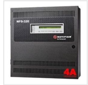
Notifier Fire Alarm Panel