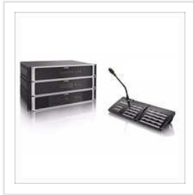
Bosch IP PA System