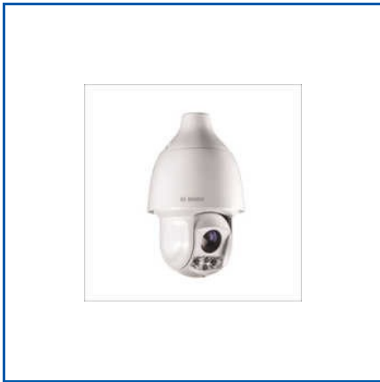
BOSCH PTZ CAMERA

120W Power Amplifier LBB1930, 15W Ceiling Speaing -LC1-PC-15G6-6, 2MP Hyundai IP Bullet Camera, 480W Power Amplifier -LBD1938, 6 Zone Call Station LBB1946, BOSCH 30W HORN SPEAKER, Bosch 2MP PTZ Camera NDP-5512-Z30L, Bosch 30W Wall Mount Speaker, Bosch Discussion Device Long -CCSD-DL, etc.