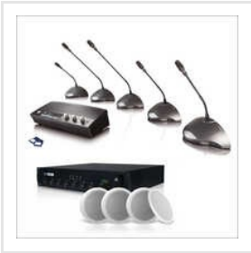
Bosch Conference System