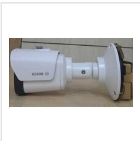
Bosch- 5MP Bullet Camera NBE3703-AL