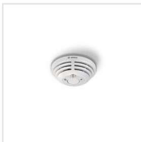
Bosch Multi Sensor Detector