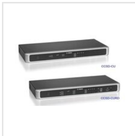
Bosch Conference System - CCS1000D-