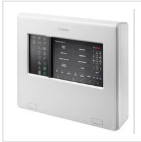
Bosch - Repeater Panel FPE-8000-FMR