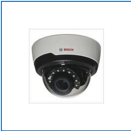
BOSCH DOME CAMERA