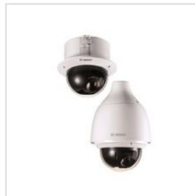
Bosch 2MP PTZ Camera NDP-5512-Z30L