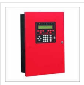
Bosch Fire Alarm Panel