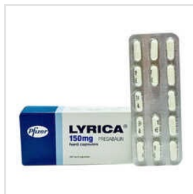
150 Mg Lyrica Pregabalin Hard