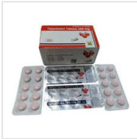
250 Mg Tapentadol Tablets