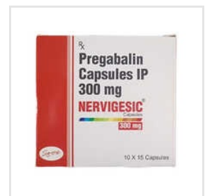
NERVIGESIC 300mg Pregabalin Capsules IP