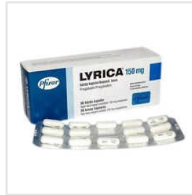
150 Mg Lyrica Harda Kapslar-Kapseli Kova