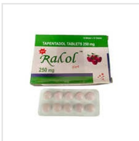
01_250mg Royal Fort Tablets