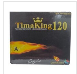
TimaKing 120 Capsules