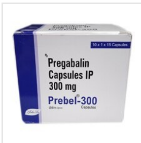
300mg Pregabalin Capsules IP