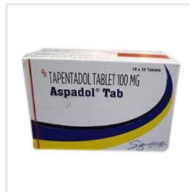
100 Mg Tapentadol Tablet