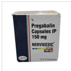
150 Mg Pregabalin Capsul