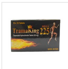
01_Mega TaramaKing 225 Hydrochloride