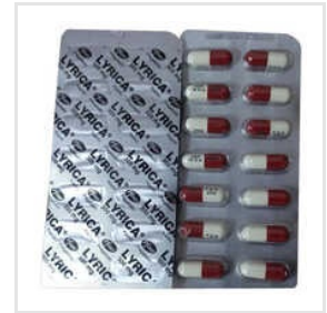
300 Mg Lyrica Capsules