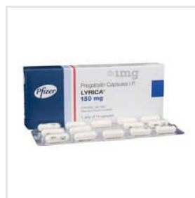
150 Mg Lyrica Pregabalin Capsules IP