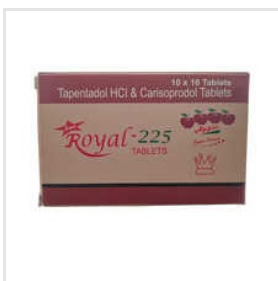
01_Royal 225 HCl And Tablets