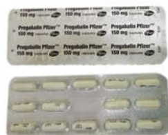
150 MG PREGABALIN PFIZER CAPSULES