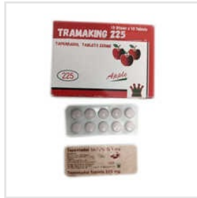
225 Mg Tapentadol Tablets