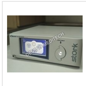
Led Light Source