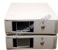
STRYKER REFURBISHED CAMERA