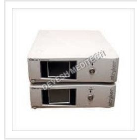
Laparoscopy Camera Refurbished Camera