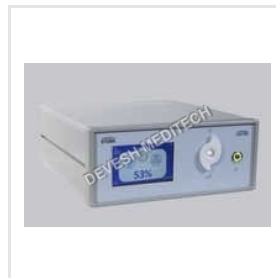
Hybrid Laser-Led Source