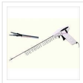
Vessel Sealing Instrument