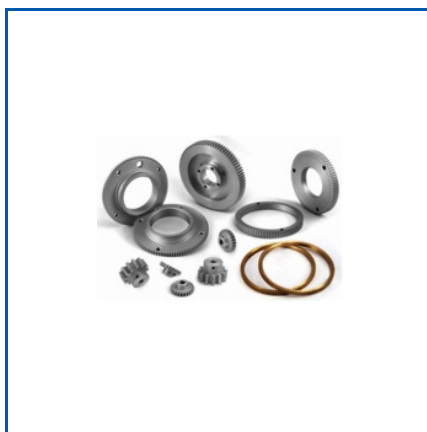
FINE PITCH GEARS