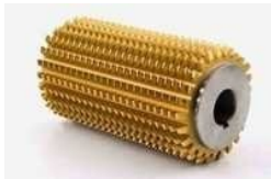
Spline Hob Cutter