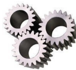
Non Standard Gears