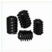
Single & Multistart Cutters