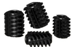
Worm Wheel Cutters