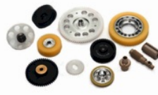
Non Metallic Gears