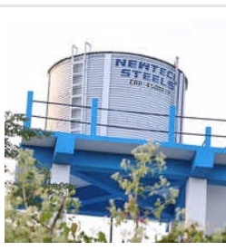
Zincalume Storage Tanks