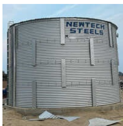
Zinc Aluminum Liquid Storage Tank