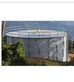
Industrial DM Water Storage Tank