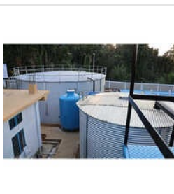
Fire Fighting Water Tank