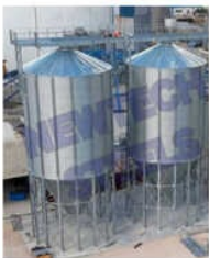
COMMERCIAL HOPPERS BOTTOM SILO

100 KL Treated Water Storage Tank, 100000L Zinc Aluminium Water Tank, 120000L Zinc Aluminium Water Storage Tank, 150 KL Corrugated Steel Tank, 200000L Zinc Aluminium Water Tank, 20000L Zinc Aluminium Water Tank, 220000L Zinc Aluminium Water Storage Tank, 250000L Zinc Aluminium Water Tank, 300 KL Zincalume Fire Hydrant Water Storage Tank, 300000L Zinc Aluminium Water Tank, etc.