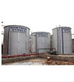
300000L Zinc Aluminium Water Tank