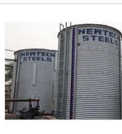
250000L Zinc Aluminium Water Tank