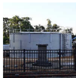
50000L Zinc Aluminium Water Tank