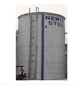
Zinc Aluminium Water Tank