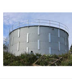
150 KL Corrugated Steel Tank