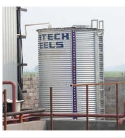
Fire Water Tanks