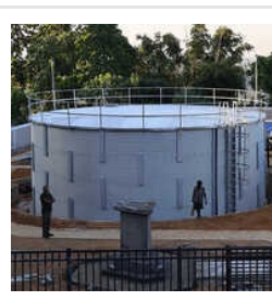
220000L Zinc Aluminium Water Tank