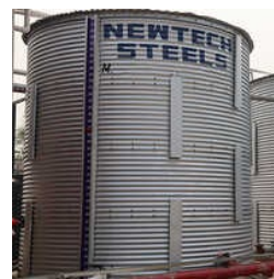
Fire Hydrant Steel Storage Tank