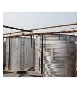
Corrugated Zincalume Tank