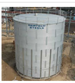
500000L Zinc Aluminium Water Tank