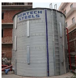
Larger Capacity Storage Tanks