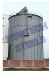
FLAT BOTTOM GRAIN STORAGE SILOS