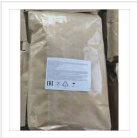
Food Grade Sodium Gluconate Powder