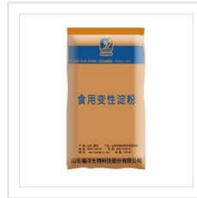
Edible Grade Modified Starch