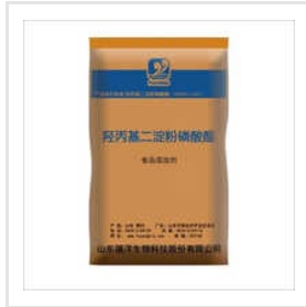
Hydroxypropyl Distarch Phosphate