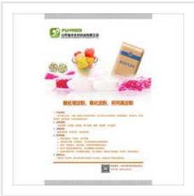
Acid Treated And Oxidized Starch