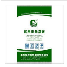
Waxy Maize Starch