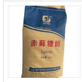
25 Kg Erythritol Powder