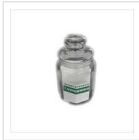
Industrial Grade Sodium Gluconate