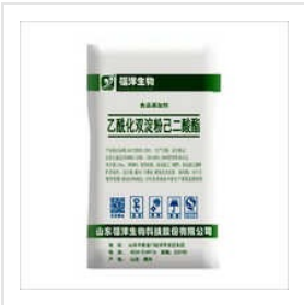
Acetylated Double Starch Adipate