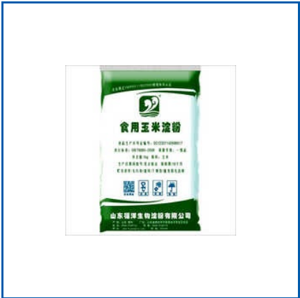
CORN STARCH POWDER