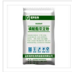
Phosphate Double Starch