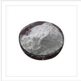
White Modified Starch