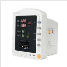
3 Parameter Contec Monitor