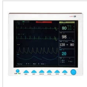
Parameter Contec Monitor