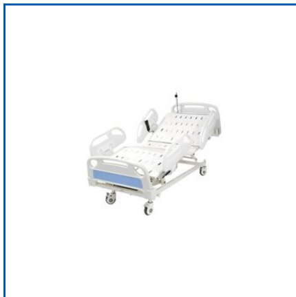
ELECTRIC ICU BEDS