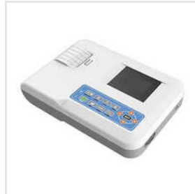
1 Channel ECG Machine