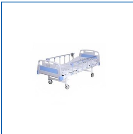
ELECTRICAL FOWLER BEDS

1 Channel ECG Machine, 3 Parameter Contec Monitor, 6 Channel ECG Machine, Adson Tissue Forceps Toothed, Allengers X-RAY Machine, Allis Grasper Single Action, Appendectomy Instrument Kit, Arterial Blood Gas Machine, Autoclave Fumigator, Autoclave Pressure Cooker, BMC Bipap Machine, BPL Anesthesia Workstation, Baby Crib Bed, Backhaus Towel Forceps, Biochemistry Analyzer, etc.