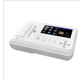
6 Channel ECG Machine