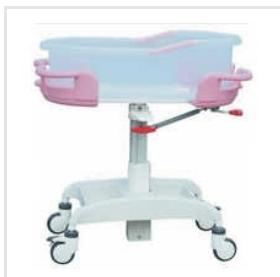
Baby Crib Bed