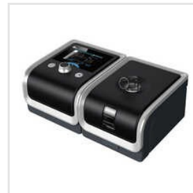
BMC Bipap Machine