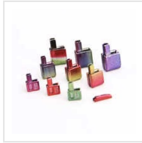
Rainbow Zipper Parts