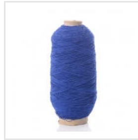
Latex Elastic Thread