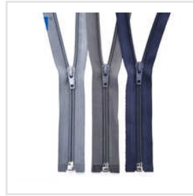
Open End Auto Lock Nylon Zipper