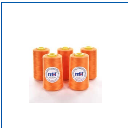
100% SPUN POLYESTER SEWING THREAD

0.5mm Nylon Beading String Thread, 100% Cotton Lace Crochet Knitting Yarn, 100% Nylon Black Hook Loop Tape, 100% Spun Polyester Sewing Thread, 10mm Sewing Elastic Bands, 110-24304 Knee Press Lifter Rod, 110w Hot Glue Gun, 12 mm Polyester Boning, 12Mm Leather Bias Binding Piping Cord, 150D-48F DTY Polyester Yarn, 170T Taffeta Lining Fabric, 190T Pongee Lining Fabric, 2 Holes Plastic Cord Stopper, 2 Light Weight Golden Brass Zipper, 20mm Camouflage Polyester Webbing, etc.