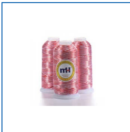
600D-1 120G VARIEGATED RAYON EMBROIDERY THREAD