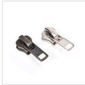
Auto Lock Resin Zipper Slider