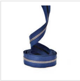
Music Teeth Plastic Zipper Chain