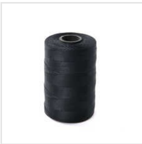
High Tenacity Polyester Sewing