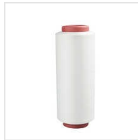
Spandex Elastane Lycra Yarn