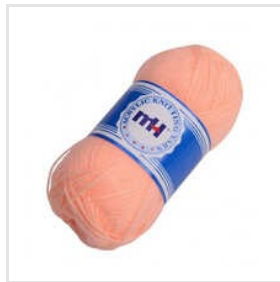
Baby Wool Yarn