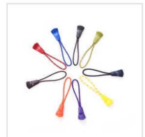
Zipper Replacement Cord Rope