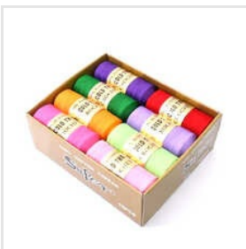
100% Cotton Lace Crochet Knitting Yarn