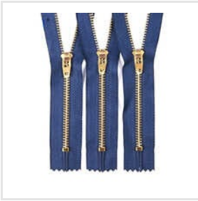
Double Locked Teeth Jeans Metal Zippers