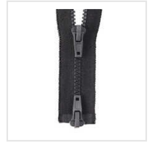
Two Ways Aramid Fire Retardant Zippers