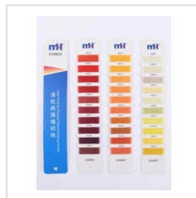
High Tenacity Polyester Sewing