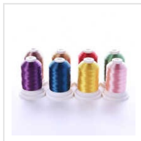
Polyester Embroidery Thread Kit