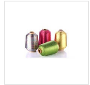
MX Type Metallic Flat Yarn