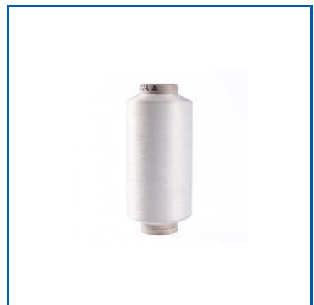
150D-48F DTY POLYESTER YARN