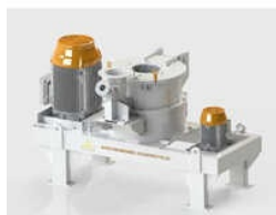
INDUSTRIAL AIR CLASSIFYING MILL

Air Classifier Mill Grinding System, Air Classifying Mill Plant, Bag Dump Station System, Besan Making Machine, Big Bag Unloading System, Brewery Grain Handling System Supplier, Centralize Vacuum Conveying System, Chilli Grinding Plant, Dense Phase Vacuum Conveying System, Hammer Mill Pulverizer, Heavy Duty Delumper Crusher, Inclined Screw Conveyor, Industrial Air Classifying Mill, Industrial Centrifugal Fan, Industrial Diverter Valve, etc.