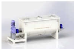
Industrial Ribbon Blender