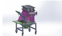
Bag Dump Station System