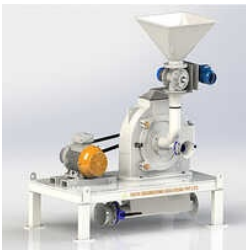
Industrial Universal Mill