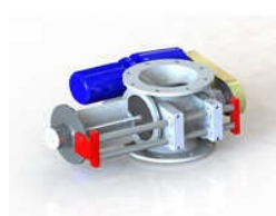
ROTARY AIRLOCK VALVE