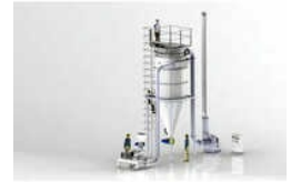
Spice Processing Machine