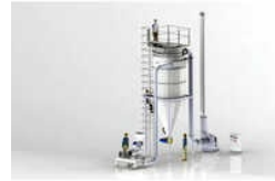
Air Classifier Mill Grinding System