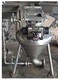
Dense Phase Vacuum Conveying System