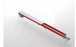
MS Screw Conveyor