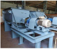
Industrial Ribbon Blender