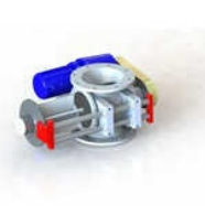
ROTARY AIRLOCK VALVES