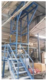
Jumbo Bag Unloading System