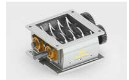
Heavy Duty Delumper Crusher