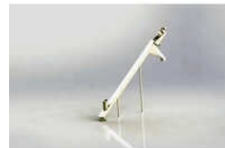
Inclined Screw Conveyor