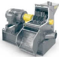
Stainless Steel Hammer Mill