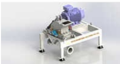
Industrial Pulverizer Machine