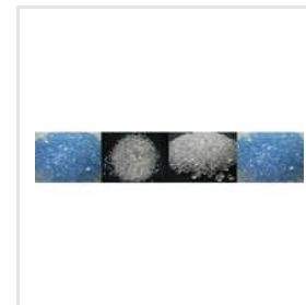
Virgin PVC Compound For Footwear Industry