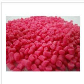
Reprocessed PVC Compound For