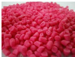
REPROCESSED PVC COMPOUND FOR INDUSTRY

Blue Masterbatch, Green Masterbatch, Purple Masterbatch, Reprocessed PVC Compound Construction Industry, Reprocessed PVC Compound For Automobiles Industry, Reprocessed PVC Compound For Footwear Industry, Reprocessed PVC Compound For Industry, Virgin PVC Compound For Automobiles Industry, Virgin PVC Compound For Construction Industry, Virgin PVC Compound For Footwear Industry, Virgin PVC Compound For Industry, Yellow Masterbatch, etc.