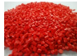
REPROCESSED PVC COMPOUND FOR FOOTWEAR INDUSTRY