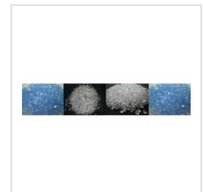
Virgin PVC Compound For Automobiles