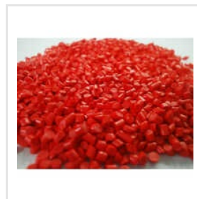
Reprocessed PVC Compound For