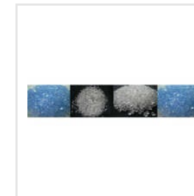
Virgin PVC Compound For Construction