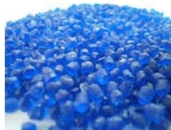
REPROCESSED PVC COMPOUND FOR AUTOMOBILES INDUSTRY