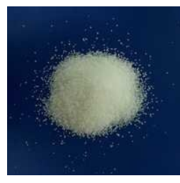
Sodium Bisulphate Monohydrate EP