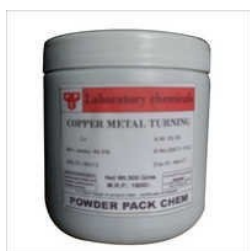
COPPER METAL TURNING

4-Bromophenol, 4-tert Butyl Catechol, Acetanilide Powder, Aluminium (Metal) Foil Roll, Aluminium Acetate, Aluminium Ammonium Sulfate, Aluminium Chloride Anhydrous, Aluminium Chloride Hydrated, Aluminium Fluoride, Aluminium Nitrate, Aluminium Oxide G [Neutral], Aluminium Potassium Sulphate A.R., Aluminium Silicate Hydrate, Aluminium Stearate, Aluminium Sulphate purified, etc.