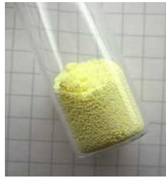
Sodium Peroxide Granular