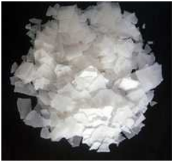
Sodium Hydroxide Flakes