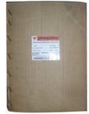
Sodium Hydroxide Pellets