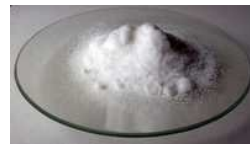
Calcium Nitrate Tetrahydrate