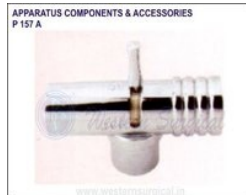
P 157 A APPARATUS COMPONENTS AND