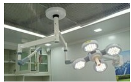
LED Light L 3 Ceiling Model