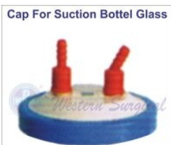
Cap For Suction Bottel PVC Glass For Medical