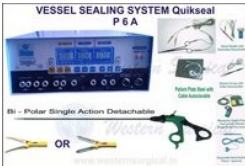
VESSEL SEALING SYSTEM Quikseal