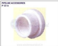
P 121 A PIPELINE ACCESSORIES