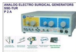
ANALOG ELECTRO SURGICAL GENERATORS