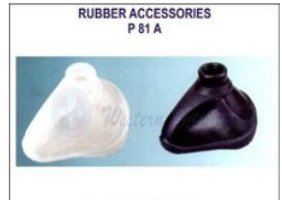
P 81 A RUBBER ACCESSORIES