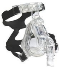
BIPAP MASK LARGE

"k" Wire (double Ended), "l" Buttress Plate, "t" Buttress Plate, 'l' Hook, 'l' Hook Ptf, (circuit Adaptors – Plastic), 0029 P 29 a Medical Batteries, 0036 Oxygen Concentrator Flow/single Dual Flow, 0037 Oxygen Concentrator Flow/single Dual Flow, 0038 Oxygen Concentrator Flow/single Dual Flow, 0039 Oxygen Concentrator Flow/single Dual Flow, Etc.