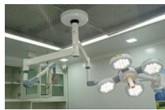
HI-LED Illumine 4 Single