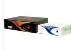
0059 MEDICAL BATTERIES