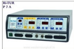
BI - TUR