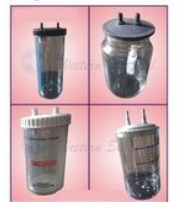
Suction Jars Polycarbonate