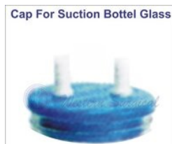
Cap For Suction Bottle Glass