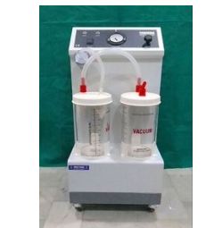
Powervac Suction Machine