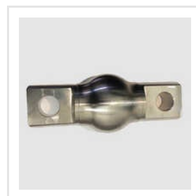
Torque Arm Pin