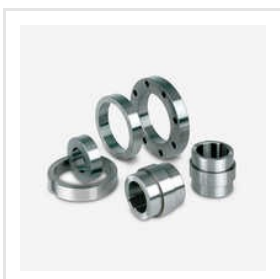
CNC Tured Rings