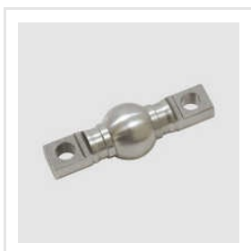
Normal Torque Arm Pin