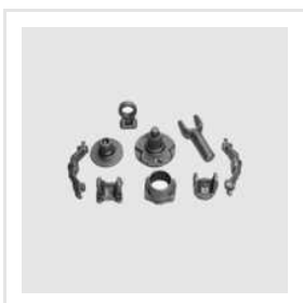
Automotive Metal Components