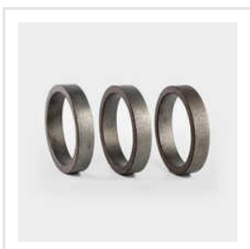
Customize Forged Ring