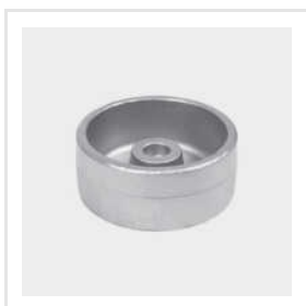
Cam Shaft Break Drum