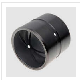
Hardened Steel Bushes