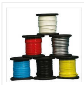
Flexible Silicon Rubber Coated Fiberglass