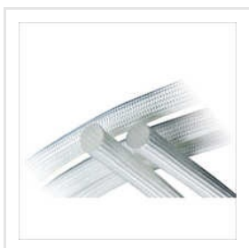
Heat Treated Braided Fiberglass Sleeve