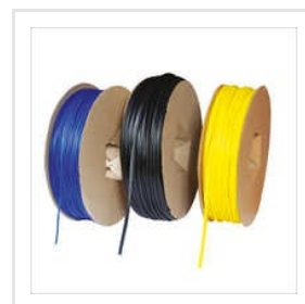
Acrylic Coated Fiberglass Sleeve