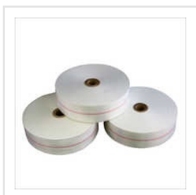
Non Adhesive Glass Polyester Tape