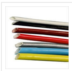
Silicone Rubber Coated Fiberglass Sleeve