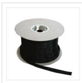
Nylon Monofilament Sleeve