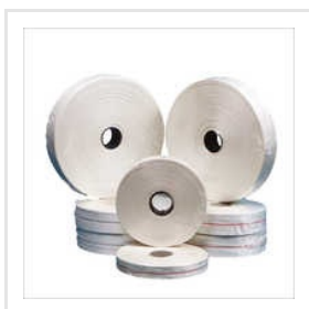
Adhesive Fibreglass Tape