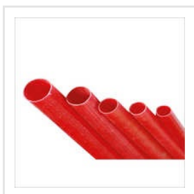
Polyurethane Coated Fiberglass Sleeve