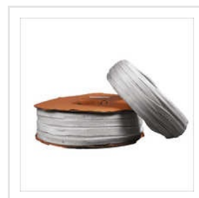
KIRAFFH - 550 Fibreglass Flat Hose