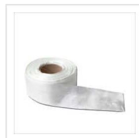
Non Adhesive High Tensile Fibreglass Tape