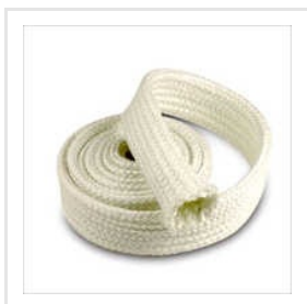
KIRAPFH - 155 Polyester Flat Hose