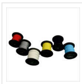
Silicone Rubber Coated Fiberglass Sleeve