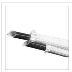
Glass Braided Acrylic Coated Fiberglass