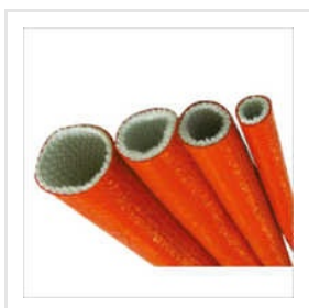
Silicon Coated Fiberglass Fire