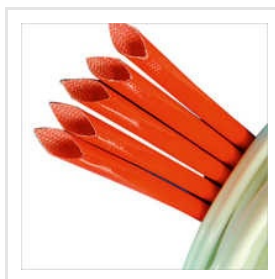
Silicone Rubber Coated Fiberglass Sleeve