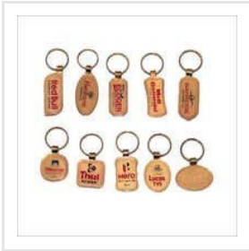
Metal Golden Printing Keyring