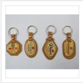
Metal Golden Patta Keychains