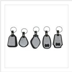
Metal Golden & Chrome Polish