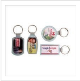
Round Crystal Keychain