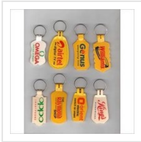
ABS Plastics Keychain