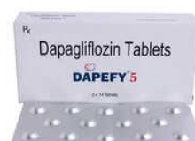
5 Dapagaliflozin Tablets