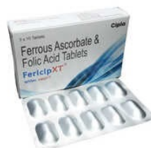
Ferrous Ascorbate And Folic Acid Tablet