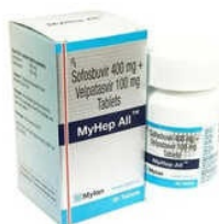
SOFOSBUVIR 400 MG VELPATASVIR 100MG TABLETS