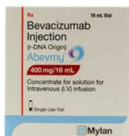
16 ML Bevacizumab Injection