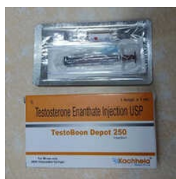
250mg Enanthate Injection