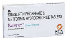
50-1000mg Sitagliptin Phosphate And