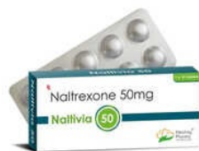
50mg Naltrexone Tablets