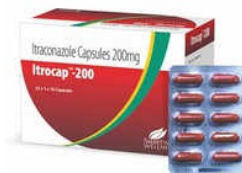
200mg Itraconazole Capsules