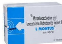
Montelukast Sodium And Levocetirizine