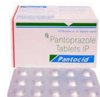
Pantoprazole Tablets IP