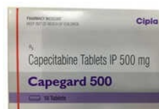
500 Mg Capecitabine Tablets IP