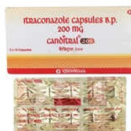
200mg Itraconazole Capsule