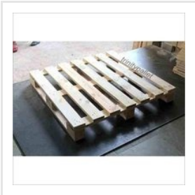
Four Way Wooden Pallet