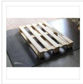
Four Way Pine Wood Pallet