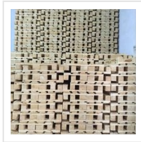
Wood Shipping Pallet