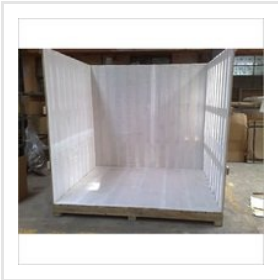
Custom Wooden Crates