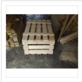
Wooden Packing Crates