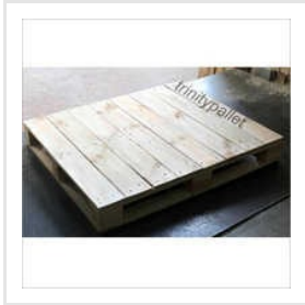
Platform Type Four Way Pine Wood Pallet