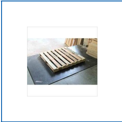
TWO WAY HARDWOOD PALLET