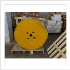
Cable Drum Pallets