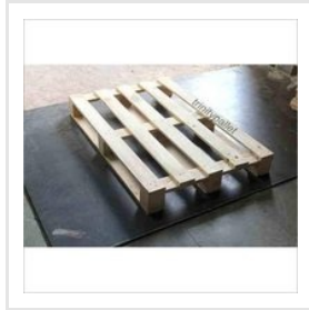
Soft Wood Pallet