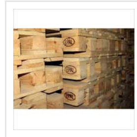
EPAL Wooden Pallets