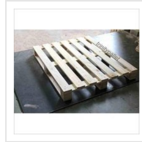
Wooden Softwood Pallet