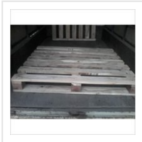
Wooden Storage Pallet