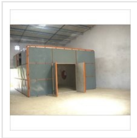
Heat Treated Pallets