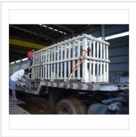
Heavy Duty Wooden Crates