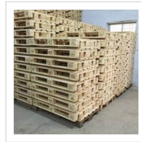
Pinewood Shipping Pallet