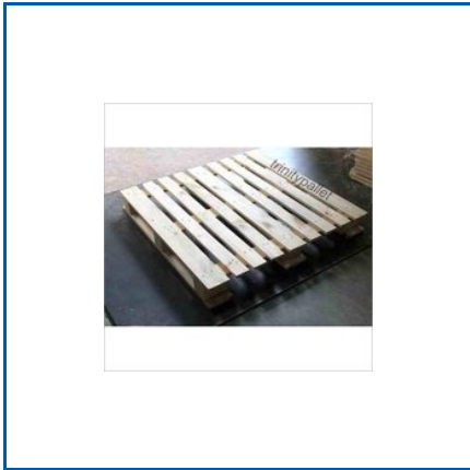
CHEMICAL WOODEN PALLET