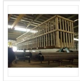
Industrial Wooden Crate