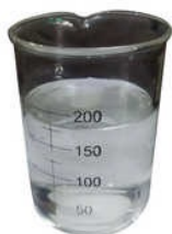
Dry Strength Resin Solution