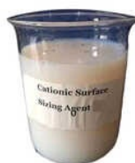
Cationic Surface Sizing Agent