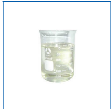
ASH BOOSTER SOLUTION