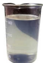
Ammonium Zirconium Carbonate Chemical