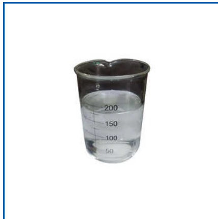
DRY STRENGTH RESIN SOLUTION