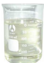
Ash Booster Solution