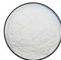
Carboxy Methyl Cellulose Powder