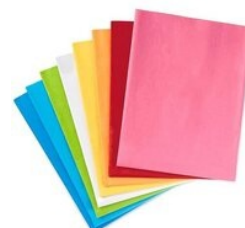
Colour Tissue Paper