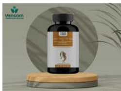
Hair Heart Joint And Skin Softgel Capsules