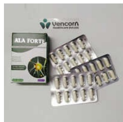
Ala Forte Tablets