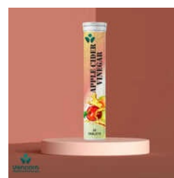
APPLECIDER VINEGAR EFFERVESCENT TABLETS