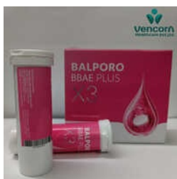
Balporo Bbae Plus Tablets