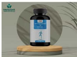
Calcium Citrate Softgel Capsules Fortified With