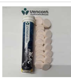
Pre Workout Tablets