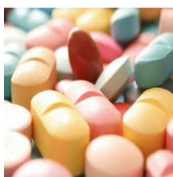
AYURVEDIC ORAL CHEWABLE TABLETS

Ala Forte Tablets, Alphalipoic Tablets, AppleCider Vinegar Effervescent Tablets, Ayurvedic Oral Chewable Tablets, Balporo Bbae Plus Tablets, Bota Sure, Calcium Citrate Softgel Capsules Fortified With Calcium Carbonate And Vitamin B12, Calzio Tablets, D 2 Tablets, Enzyme Syrup, etc.