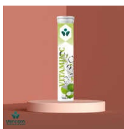
VITAMIN C TABLETS