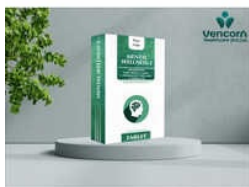
Mental Wellness-2 Fortified With Ginkgo