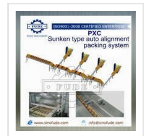
Sunken Type Auto Alignment Packing