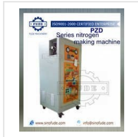
Series Nitrogen Making Machine