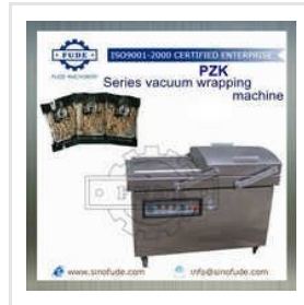
Series Vacuum Wrapping Machine