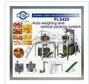
Vertical Packing System