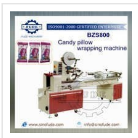
Candy Pillow Wrapping Machine