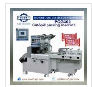
Cut & Pillow Packing Machine