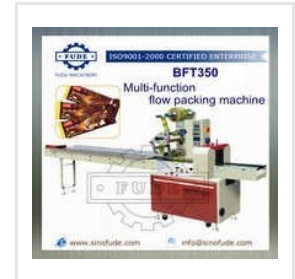
Flow Packing Machine