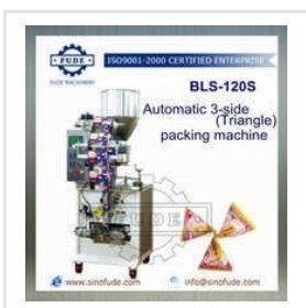
Automatic 3-Side Packing Machine