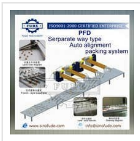
Separate Way Type Auto Alignment