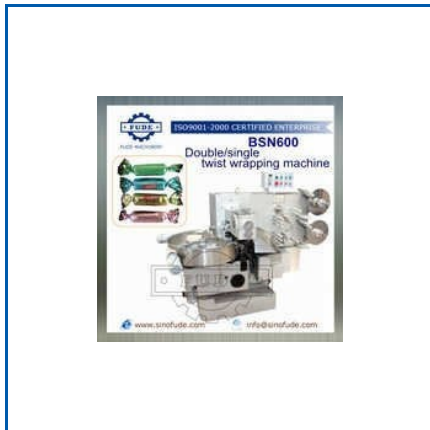
DOUBLE (SINGLE) TWIST WRAPPING MACHINE