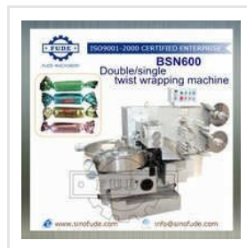
Double Twist Wrapping Machine