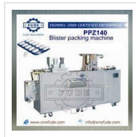
Blister Packing Machine