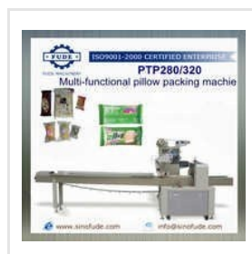
Fold Wrapping Machine