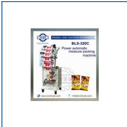
POWER AUTOMATIC MEASURE PACKING MACHINE

1000 Decorating machine, 1000L Chocolate Conche, 1000L Chocolate Holding Tank, 1000L Chocolate Melting Tank, 100L Chocolate Conche, 100L Chocolate Holding Tank, 1200 Decorating machine, 2000L Chocolate Conche, 2000L Chocolate Holding Tank, 2000L Chocolate Melting Tank, 200L Chocolate Holding Tank, 200L Chocolate Melting Tank, 25C Chocolate Pump, 275A Automatic Chocolate Molding Line, 2D Chocolate Moulds, etc.