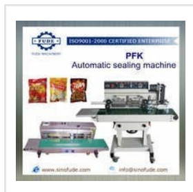
Automatic Sealing Machine