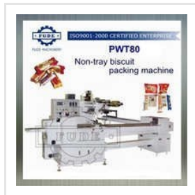
Non-Tray Packing Machine