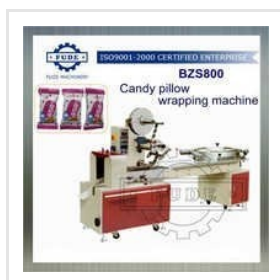
Candy Pillow Machine