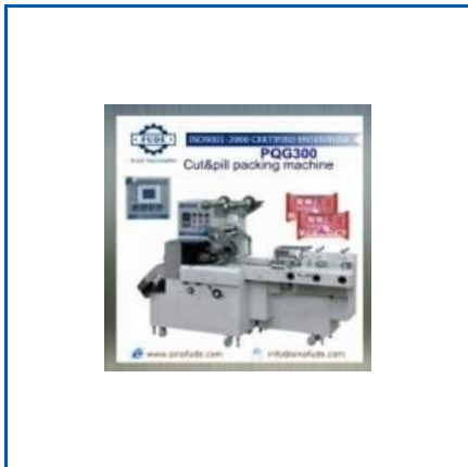
CUT & WRAP MACHINE