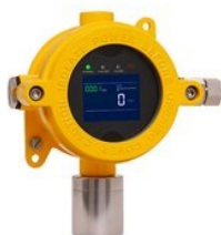
GV 108 Gas Detector