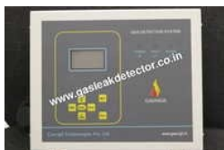
Industrial Gas Leak Detection System