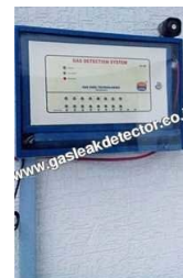
Analog Gas Leak Detector