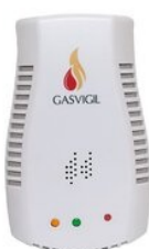
Domestic Gas Detector