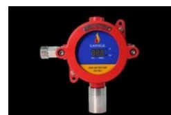
LNG Gas Leak Detector