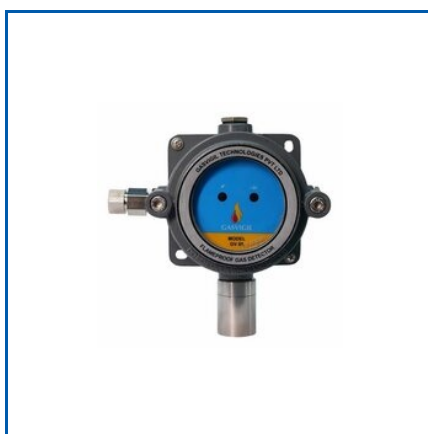
FLAMMABLE GAS DETECTOR