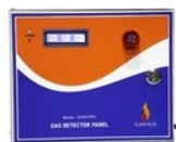
Multi Gas Detection System