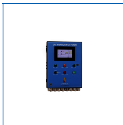
GAS MONITORING SYSTEM