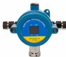
Nitrogen Gas Leak Detector