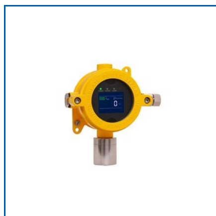
GAS LEAK DETECTOR

Analog Gas Leak Detector, CO Portable Gas Detector, Carbon Monoxide Detection System, Domestic Gas Detector, Flammable Gas Detector, GV 108 Gas Detector, Gas Detection System, Gas Detector, Gas Leak Detector, Gas Monitoring System, Hand Held Gas Detector, Hydrogen Gas Detection System, Industrial Gas Leak Detection System, LNG Gas Leak Detector, LPG Gas Detector, etc.