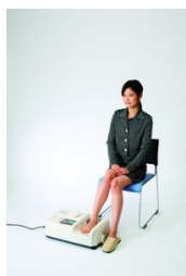
Japanese CM-300 Ultrasound Bone