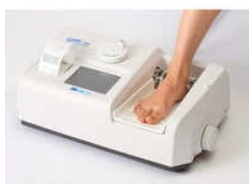
Bone Density Meter