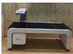
Dexa Bone Densitometer