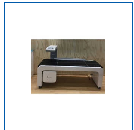
DEXA BONE DENSITOMETER