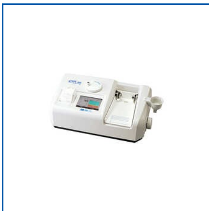
ULTRASOUND BONE DENSITOMETER

Airnergy Basis Plus Oxygen Therapy, Airnergy Oxygen Therapy, Airnergy Travel Plus, Advance Body Composition Analyser With 10.1 Touch Screen, Advance Body Composition Analyzer For Premium Gyms, Advance Body Composition Monitor For Gyms, Bmd Machine, Bmd Machine Cm-200, Bmd Machine Cm-200 Light, Bmd Machine Cm-300, Body Composition Analyzer Accuniq Bc300, Bone Densitometer Cm-200 Light, Bone Densitometer Cm-300, Bone Densitometry Machine, Bone Densitometry Osteopro Grand Mini, Etc.