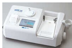
Bone Density Measuring Machine