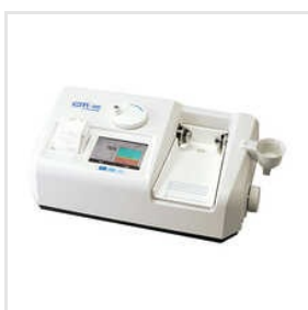
Ultrasound Bone Densitometer