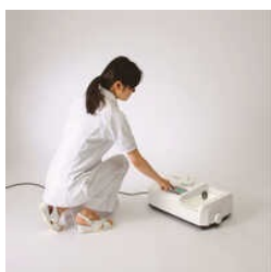
BMD Machine For Pharma Companies