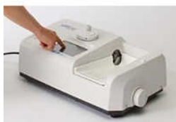
BMD Machine For BMD Camps