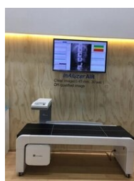
Whole Body Bone Density And Body