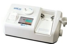
Portable Bone Densitometer