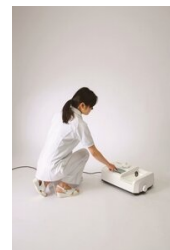
Osteoporosis Assessment Machine