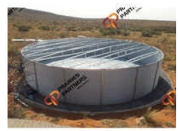
Zinc Aluminum Water Tank