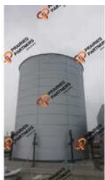
Industrial Zinc Aluminum Raw Water