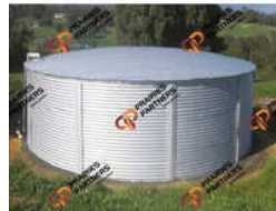
Zincalume Storage Tanks