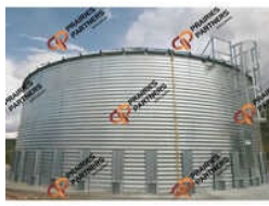
Fire Fighting Zinc Aluminium Water Tank