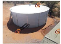
Industrial Zincalume Storage Tanks