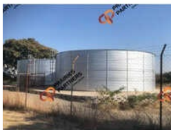
Zinc Aluminum Chemical Storage Tank