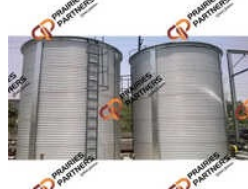
Colorbond Zincalume Tank