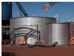
Zincalume Steel Overhead Water Tank