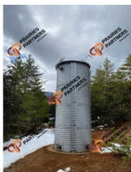
Zinc Aluminum Rain Water Storage Tank