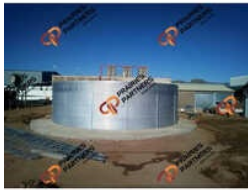
Zinc Aluminum Water Storage Tank