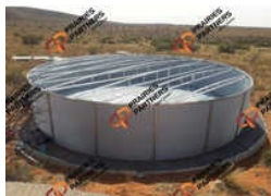
ETP STORAGE TANK

1000 KLD Effluent Treatment Plant, 12m Hopper Bottom Storage Silos, 15m Flat Bottom Storage Silos, 25000 Ltr Modular Water Storage Tank, Aluminum Storage Tank, Colorbond Zincalume Tank, ETP Storage Tank, Fire Fighting Water Storage Tanks, Fire Fighting Zinc Aluminium Water Tank, Galvanised Steel Water Storage Tank, Galvanized Water Storage Tank, Industrial Water Treatment Plant Services, Industrial Zinc Aluminium Water Storage Tank, Industrial Zinc Aluminum Raw Water Storage Tank, Industrial Zincalume Storage Tanks, etc.