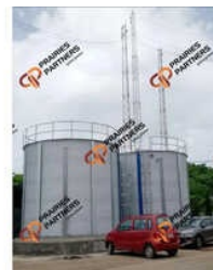
ZINCALUME STEEL WATER STORAGE TANK