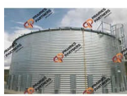
Zincalume Steel Water Storage Tank