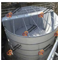
Zinc Aluminium Water Storage Tank