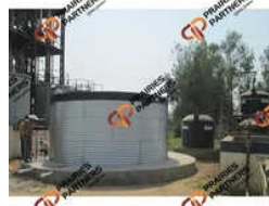
Galvanized Water Storage Tank