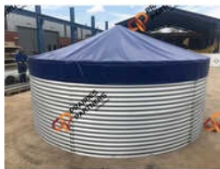
25000 Ltr Modular Water Storage Tank