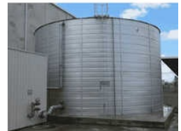
Industrial Zinc Aluminium Water