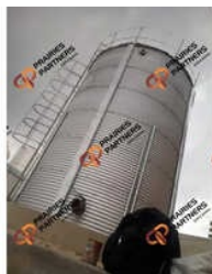
FIRE FIGHTING WATER STORAGE TANKS