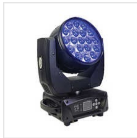
15W Dragon Aura Light