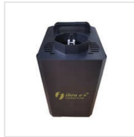
Industrial Fire Flame Machine