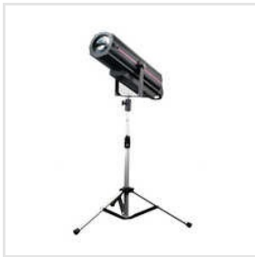
LED Follow Spot Light