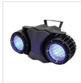
Two Eyes Waterproof Blinder Light