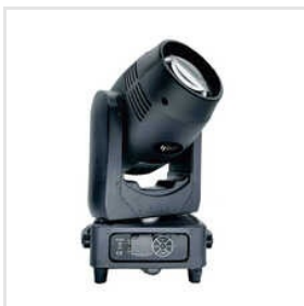
Hector 400 Beam Light