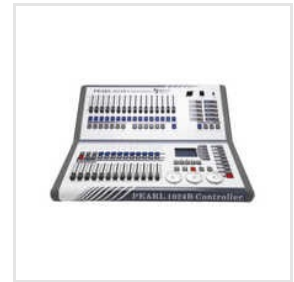
Mini Pearl Board 1024B Controller