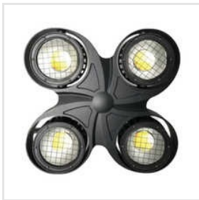
Four Eyes Waterproof Blinder Light