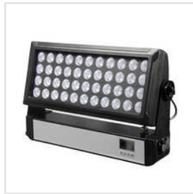
City Color Light