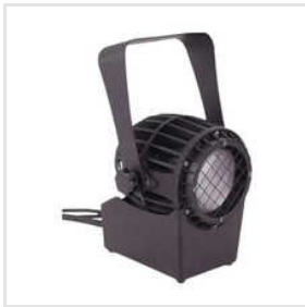
One Eyes Waterproof Blinder Light With RGB