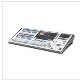
Titan-Arena Controller Board