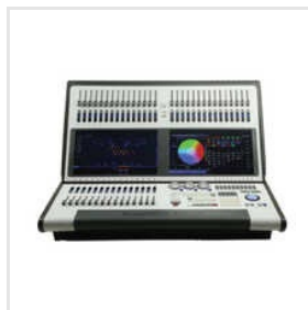
Sapphire Touch Controller