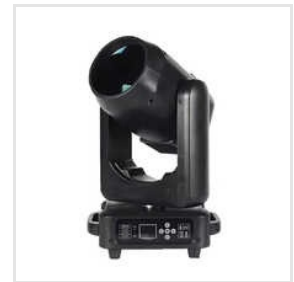
Rambo 300 Beam Light