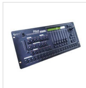
Pilot 2000 Controller Board