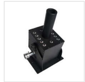
CO2 Jet Machine