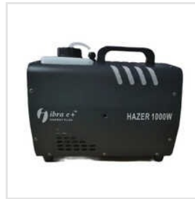
1000W Haze Machine