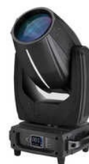
THOR 550 BEAM LIGHT