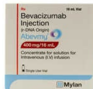
16ml Bevacizumab Injection