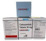
20mg Cabozantinib Tablets