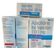
100mg Azacitidine For Injection