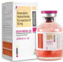
Doxorubicin Hydrochloride For Injection