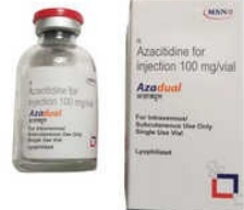
100mg Azacitidine For Injection