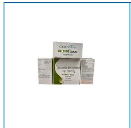
2000MG IFOSFAMIDE FOR INJECTION