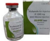
1000 Injection Ifosfamide For Injection