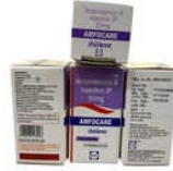
50mg Amphotericin B Injection IP