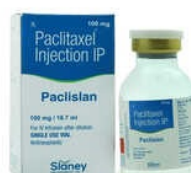
100mg Paclitaxel Injection IP