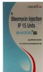
Bleomycin Injection IP 15 Units