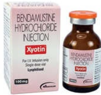
100mg Bendamustine Hydrochloride Injection