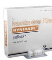
02_Hyaluronidase Injection IP