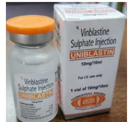
10mg Vinblastin Sulphate Injection