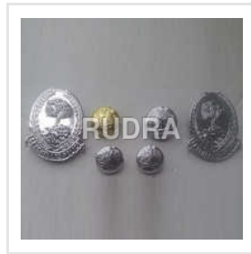
Badges & Buttons