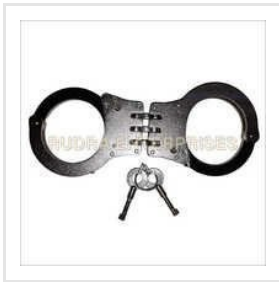
UK Mode Handcuffs