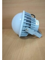
LED Well Glass LIGHT - 36W