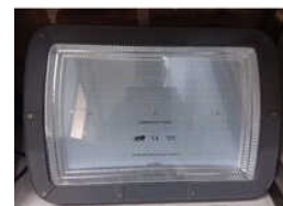
LED FLOOD LIGHT