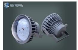
LED Well Glass LIGHT - 60W