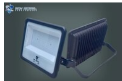
LED FLOOD LIGHT SPARK