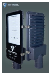
LED Street Light 72W