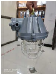
36W ExplosionProof Well Glass Light