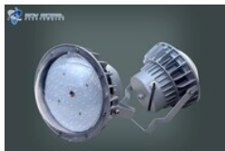
LED Well Glass LIGHT - 100W