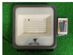
LED FLOOD LIGHT RGB 100W