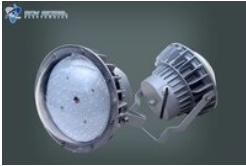
LED Well Glass LIGHT - 72W