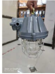
100W ExplosionProof Well Glass Light