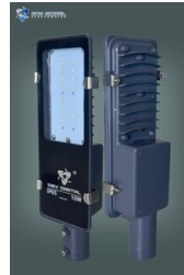
LED STREET LIGHT NILE