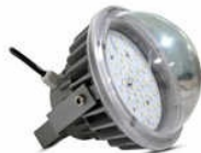
LED Well Glass Light - 60W (Corona)