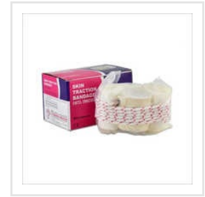
Skin Traction Kit