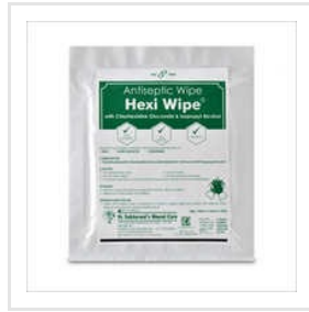
Antiseptic Hexi Wipe