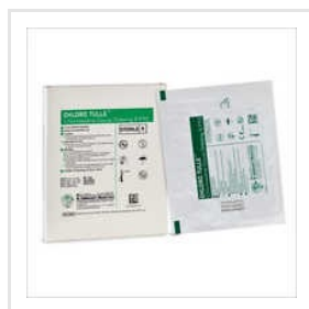
Tulle Gauze Dressing BP