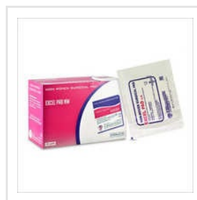
Excel Pad NW Non Woven Surgical Pad