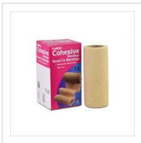
Excel Co Bandage