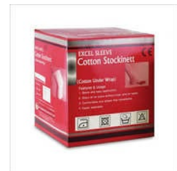
EXCEL SLEEVE COTTON STOCKINETTE