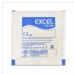
EXCEL EYE PAD

Adhesive Plaster Tape USP, Antiseptic Hexi Wipe, Antiseptic Nuvlon-D Wipe, Belladonna Plaster, Canula Fixing Strip, Capsicum Medical Plaster, Chloro Tulle Dressing BP, Cotton Crepe Bandage, Crepe Bandage, Deep Reach Rheumatic Plaster, Elastic Adhesive Bandage, Elastogrip Bandage, Excel Cast Polyurethane Casting Bandage, Excel Co Bandage, Excel Eye Pad, etc.