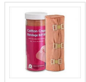
Cotton Crepe Bandage