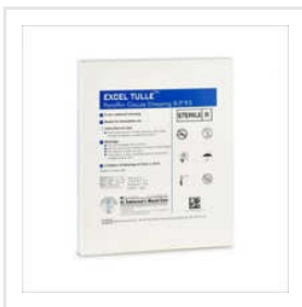
Excel Tulle Bandage