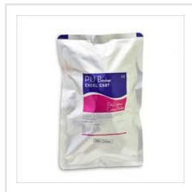
Excel Cast Polyurethane Casting