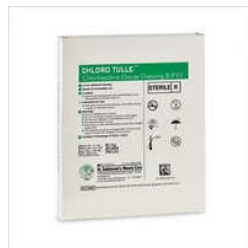
CHLORO TULLE DRESSING BP