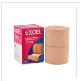
Elastic Adhesive Bandage