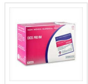
Non Woven Surgical Pad