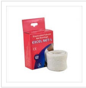
Excel Net-L Bandage