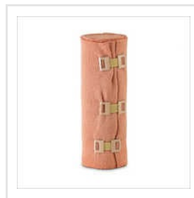
Medical Plast Bandage