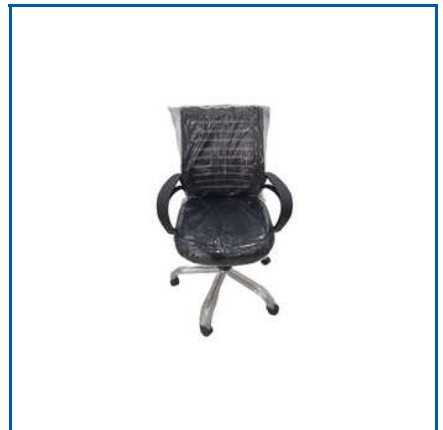
BOOM MESH CHAIR