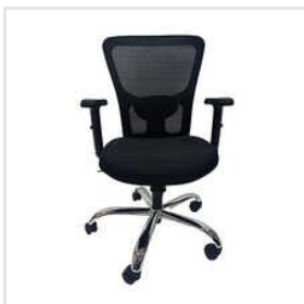
Beatle Medium Back Mesh Chair