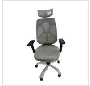
Shipan High Back Chair