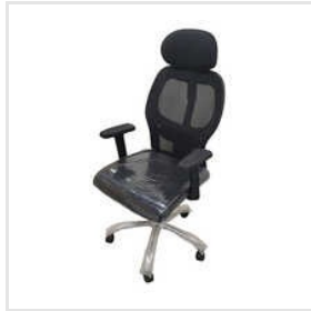
Oscar High Back Twin Seat Chair