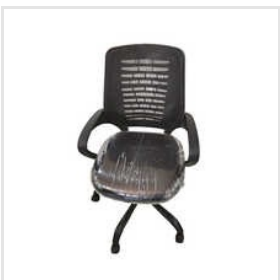
Office Mesh Chair