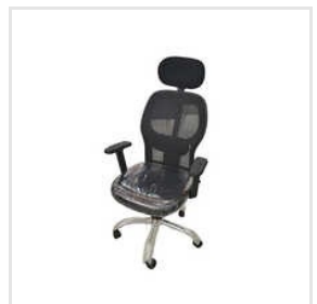
Oscar High Back Chair