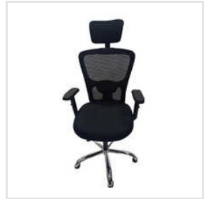
Beatle High Back Chair