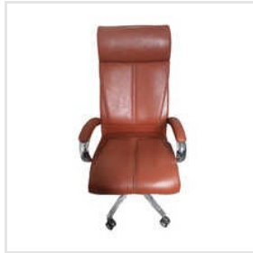
Tan Colour Executive Chair