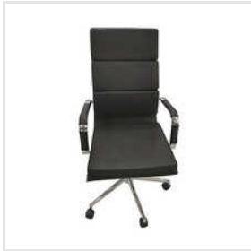
Sleek Triple Cushion Chair