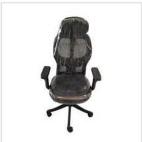
Oscar High Back Matrix Seat Chair