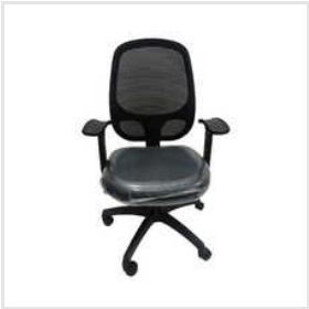
802 Mesh Chair