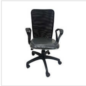
Sigma Low Back Mesh Chair