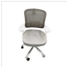
Cherry White Mesh Chair