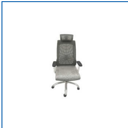
SPIDER HIGH BACK CHAIR