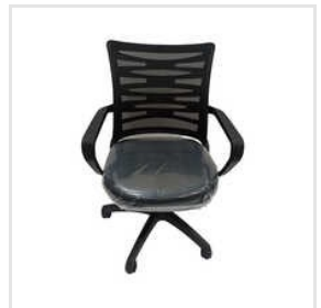
Zigzag Mesh Chair