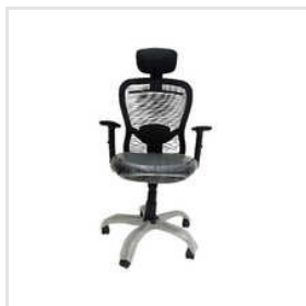
Butterfly High Back Chair