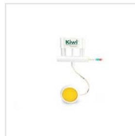
Kiwi Omni Cup Vacuum Delivery