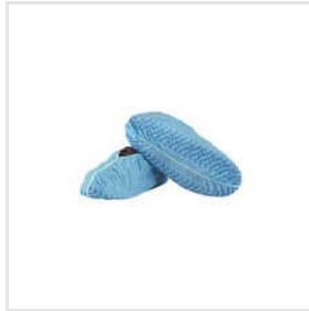
Medical Shoe Cover