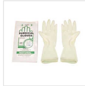
Sterile Powder Free Gloves