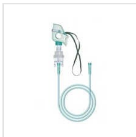
Nebulizer Medical Mask Kit Adult