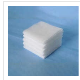
5cm X 5cm Gauze Swab