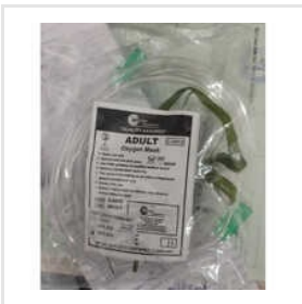
Oxygen Face Mask