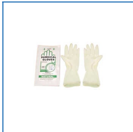
STERILE POWDER FREE GLOVES