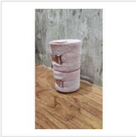
Cotton Crepe Bandages