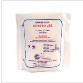
Cotton Gamjee Roll