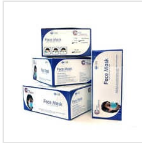
Disposable Face Mask 3 Ply