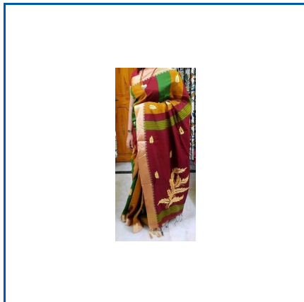
KANTHA WORK ON HANDLOOM SAREE