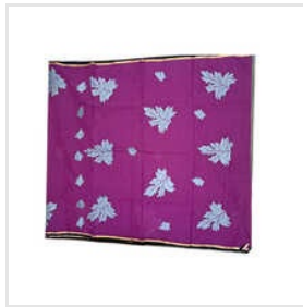
Kantha Embroidery On Pure Silk Saree