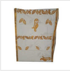
Gujrati Embroidery On Pure Silk Saree