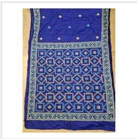
Gujrati Embroidery Premium Quality