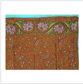
Allover Katha Embroidery On Pure