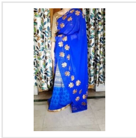
Applique Work On Blue Chiffon Saree