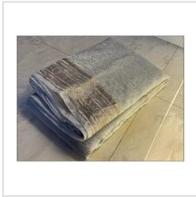
Tissue Silk Saree