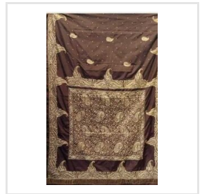
Kashmiri Embroidery On Pure Bangalore Silk