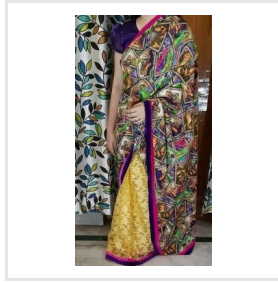
Mix And Match Brasso Saree With Pink And