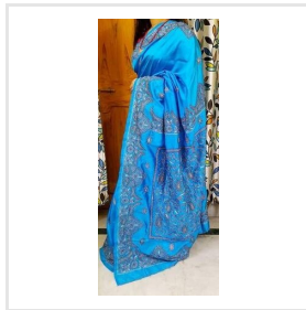
Kashmiri Hand Embroidery On