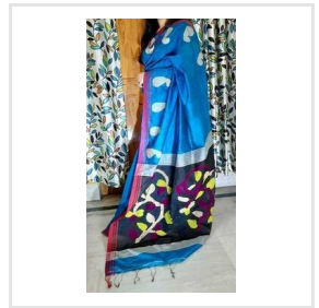
Blue Handloom Silk Saree