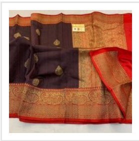
Hand Woven Pure Tasar Silk Saree