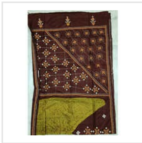
Applique Work On Tant Saree