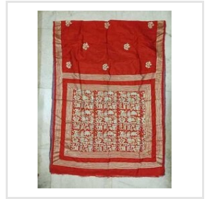
Hand Ari Embroidery On Pure Katan Silk