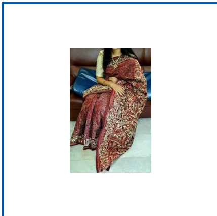
ALL OVER KANTHA STITCH ON BLENDED BANGALORE SILK SAREE